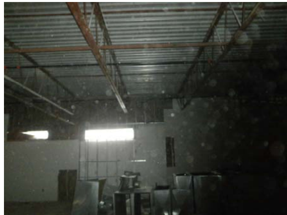
Interior photograph 3