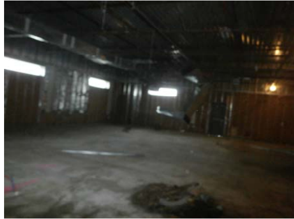
Interior photograph 1