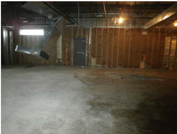
Interior photograph 2