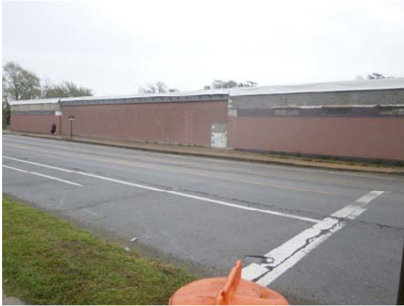
Front view of the property